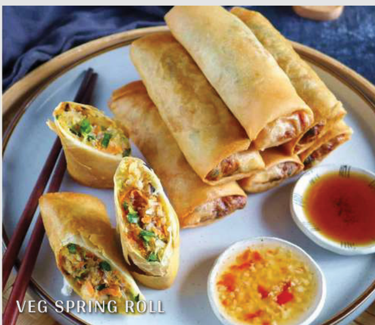
VEG SPRING ROLL